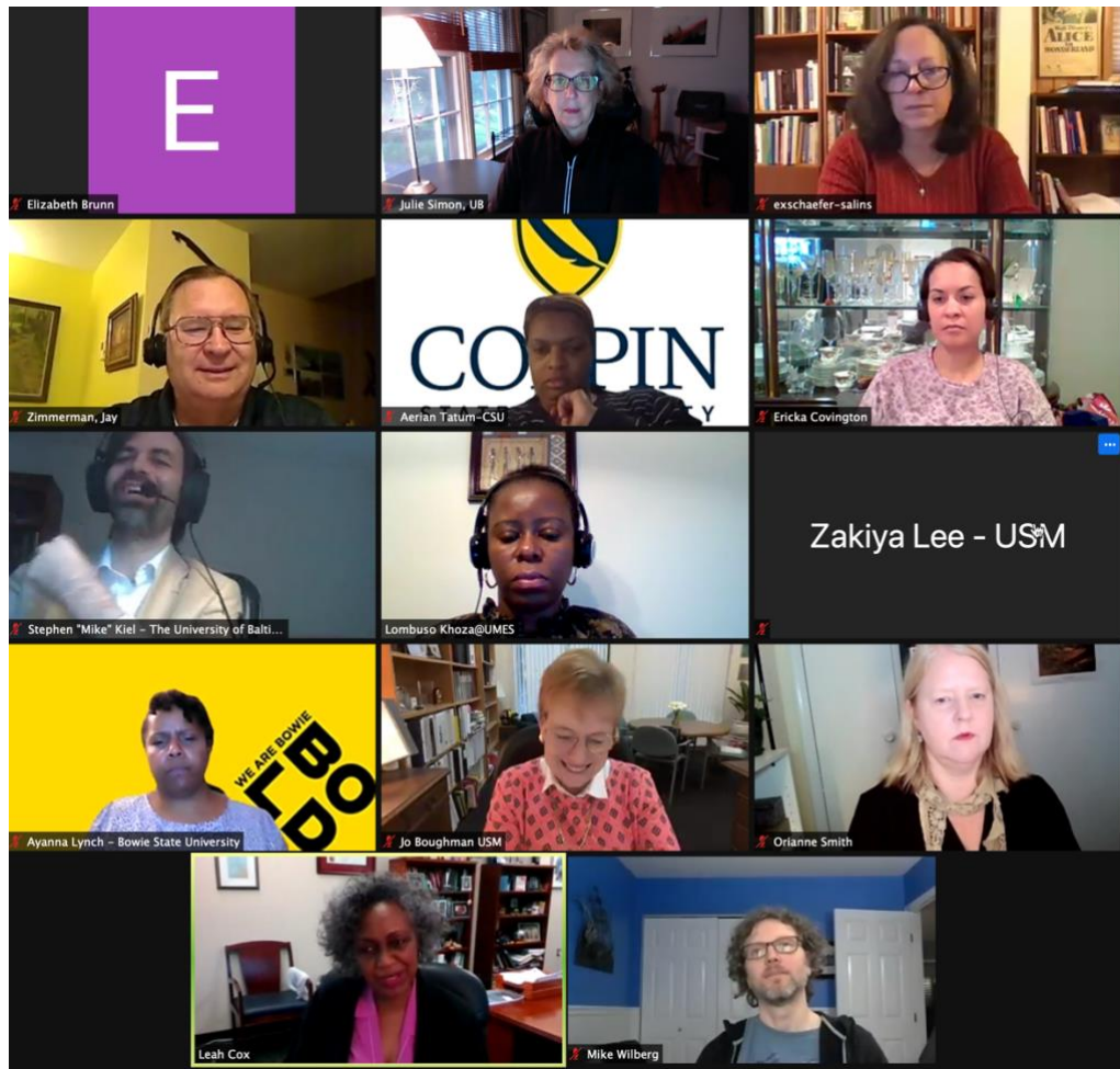
CUSF Executive Committee meets with University Faculty Presidents in October 2020