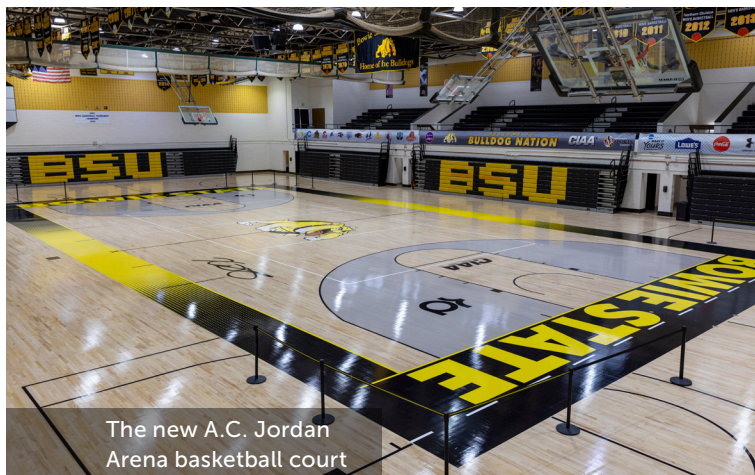
The new A.C. Jordan Arena basketball court