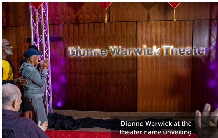
Dionne Warwick at the theater name unveiling