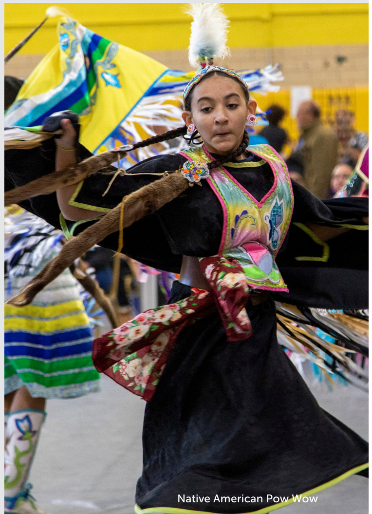
Native American Pow Wow

We hosted our inaugural Native American Pow Wow – the first authentic ceremonial Pow Wow ever held on a Maryland HBCU campus. A community celebration to kick off National American Heritage Month, the day was full of Native American cultural experiences focused on alarming social justice issues impacting the Native American community. The event included authentic food, games for children, musical and dance performances, and featured authentic Native American vendors. Attendees received free Ancestry DNA kits to trace their Native American heritage.